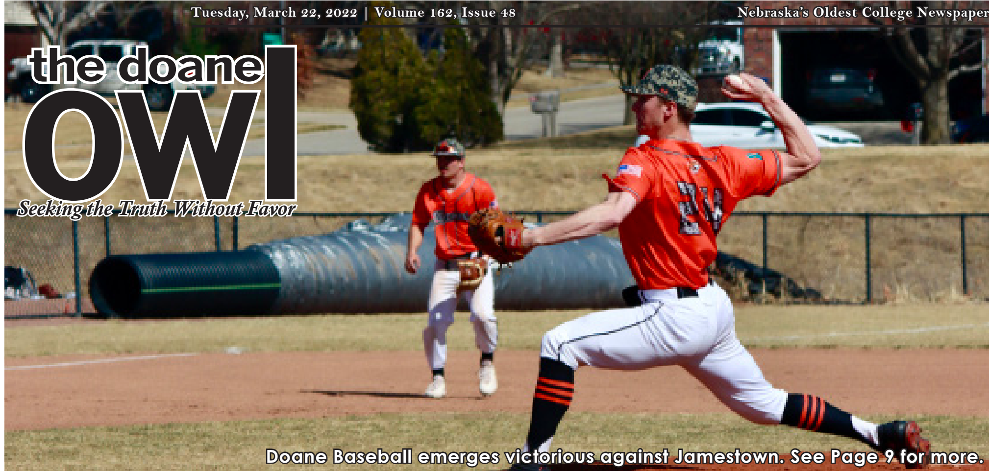
Doane Baseball emerges victorious against Jamestown. See Page 9 for more.