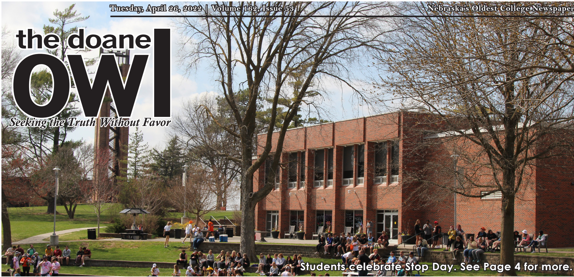
Students celebrate Stop Day. See Page 4 for more.