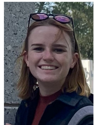
ERIN BURKE Staff Writer

Walmart brand. But these days it has gotten harder to bring myself to make my own pot of coffee.