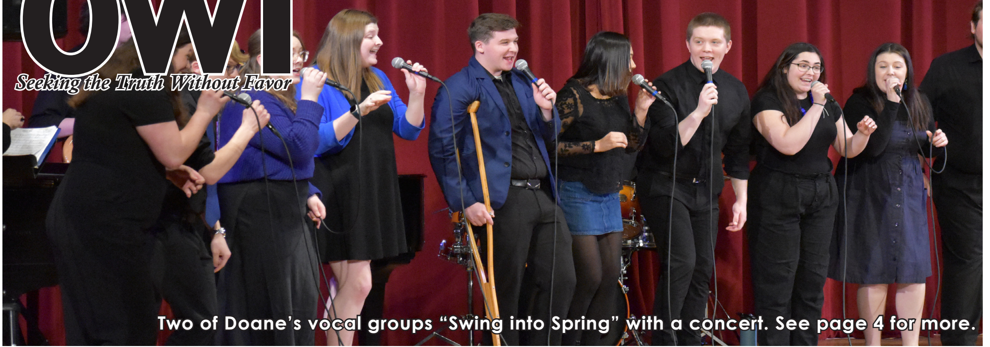
Two of Doane's vocal groups "Swing into Spring" with a concert. See page 4 for more.