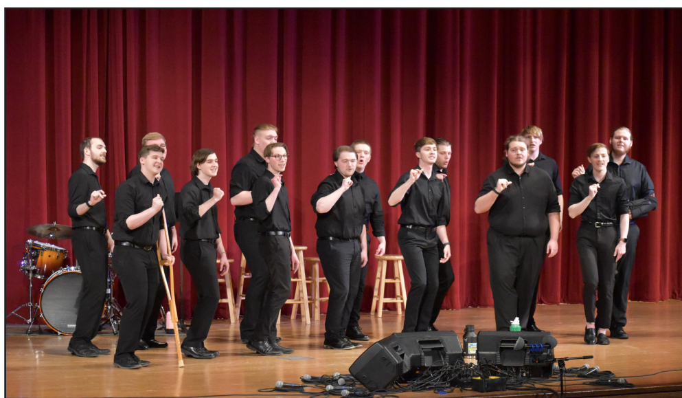
Doublewide (left) and Jazz Unlimited (right) choirs perform at the Swing into Spring concert as a conclusion of their tour to various Lincoln and Omaha schools. The concert was held March 25.