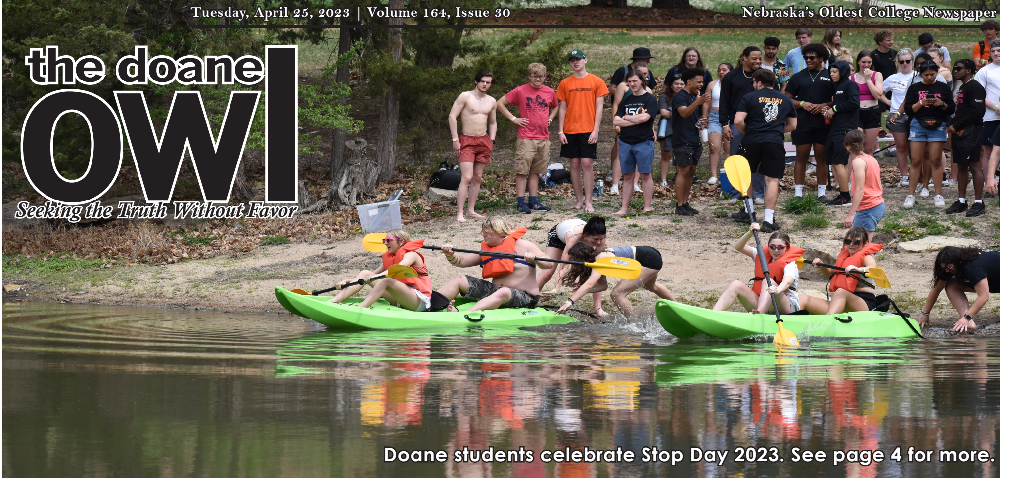
Doane students celebrate Stop Day 2023. See page 4 for more.