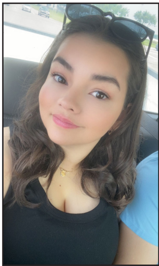
ELIYAH LARA-JOHNSON Staff Writer

are the Grammys, which is an eventful occasion in general.